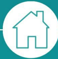
A higher resale value for your home