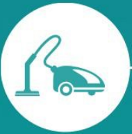
Lower cleaning and repair costs