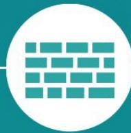
Cracks in walls