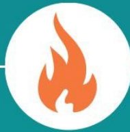
Reduced risk of fire