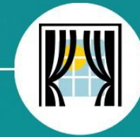
Better air quality at home